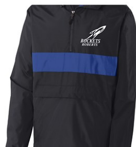
Roberts Rockets Sport-Tek® Zipped Pocket jacket $48.00