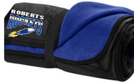
Fleece & Poly Travel Blanket $30.00