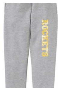
Youth Joggers $28.00