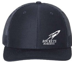
Rocket Richardson 112 Hat $24.00