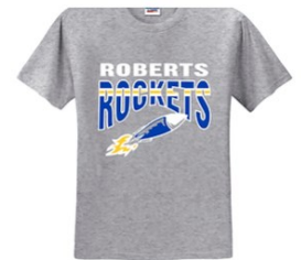
ADULT Rocket Tee $20.00