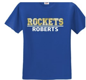
YOUTH Rocket Tee $15.00