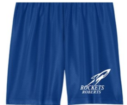
Unisex Shorts $16.00