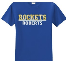
ADULT Rocket Tee $20.00