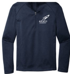
Diamond Heather Fleece 1/4-Zip Pullover $55.00