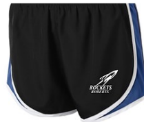
Ladies Shorts $22.00