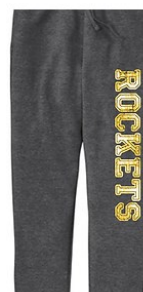
Adult Joggers $30.00