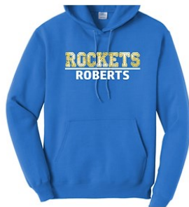
ADULT Rockets Hoodie $40.00