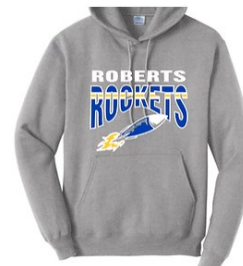
ADULT Rockets Hoodie $40.00