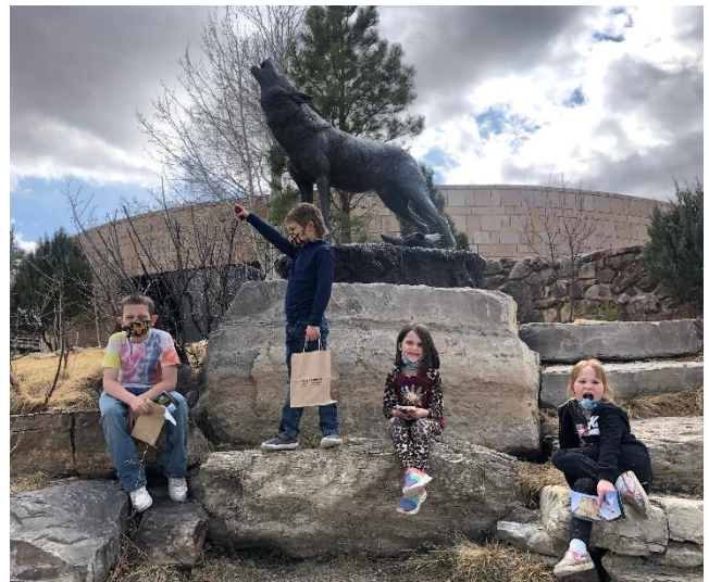
1 st Grade enjoying a day of learning and play at the Buffalo Bill Museum in Cody, WY